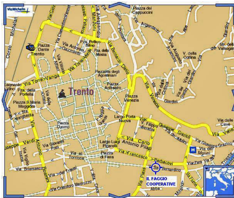
The cooperative “Il Faggio” is on via San Bernardino, 10

When you leave the Guest House, turn left and after 50 meters you will see the bus stop. Take the bus No.9 (direction Piazza Dante) and get off at the bus stop “Piazza Dante”. There catch the bus No.7 and get off at the stop “Piave Parco S. Chiara”. Walk back for about 20 meters, cross the street and you will be in Via S. Bernardino. The cooperative “Il Faggio” is in Via S. Bernardino, 10.