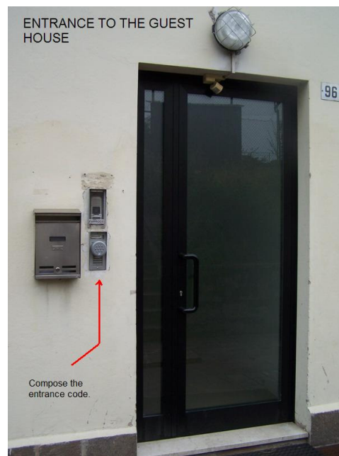
The Guest House and the entrance leading towards the apartment